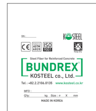
1,000 kg HDPP bag