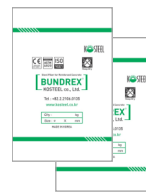
20 kg paper bag