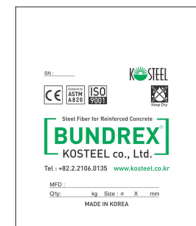
1,000 kg PP bag